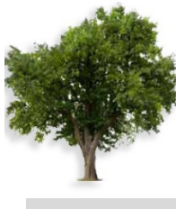
LOW CROWN OAK

Check with your City Planning Dept. for types of trees allowed in your neighborhood.